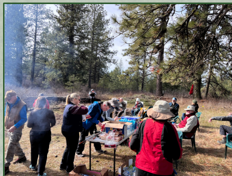
Hot Dog Roast at the Wilson Conservation Area